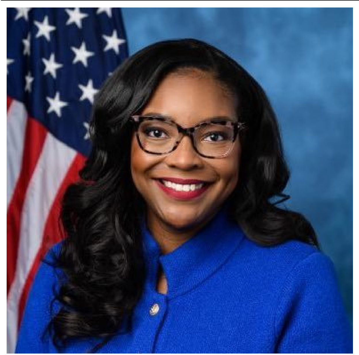
<u>Clevelandurbannews.com</u> and <u>Kathywraycolemanonlinenewsblo</u> g.com

Last week, U.S. Rep Emilia Sykes (OH-13) (pictured), an Akron Democrat and Ohio's youngest Congress person, traveled to the El Paso sector of the U.S./ Mexico border.